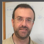
A. PALMERO (SPAIN)