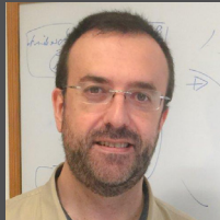
A. PALMERO (SPAIN)